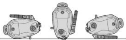
Three directions horizontal storage